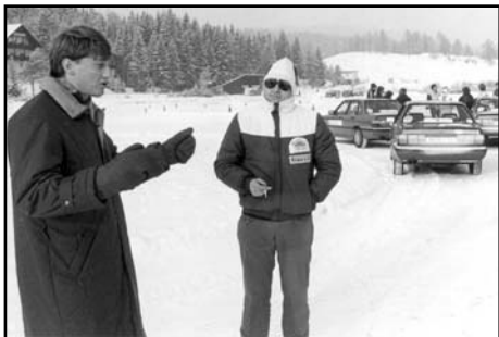
Audi Fahr- und Sicherheitstraining, Seefeld