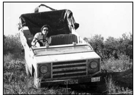
GM South African's Nomad "go-anywhere" vehicle with LS rear drive, Cape Flats