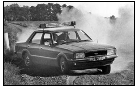
Ford proving ground, Port Elizabeth