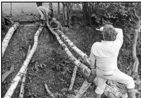
Camel Trophy training for Amazonia embraces survival skills, first aid, chain-sawing, winching, bridge building and Land Rover driving tricks