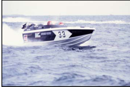
Winner: Guernsey Yacht Club Press Presentation Trophy