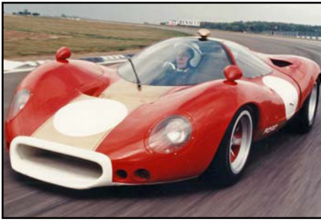
+ John Surtees, Ford P68-DFV sports prototype