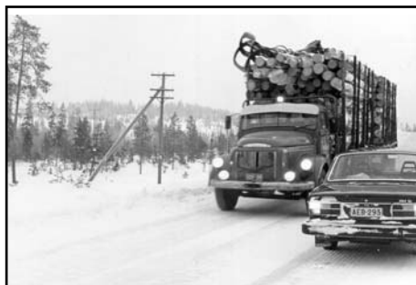
Arctic winter driving Lesson 1: timber trucks never give way to cars as they must always stay on the crown of the road or else get stuck