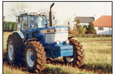
+ Ford TW35 AWD: 6.6-litre 6-cylinder turbo diesel, 192 bhp, 700 N.m torque, partial power-shift transmission, 16 forward gears, 4 reverse