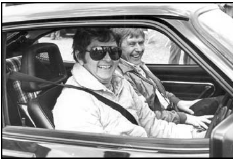
Test session, Donington Park