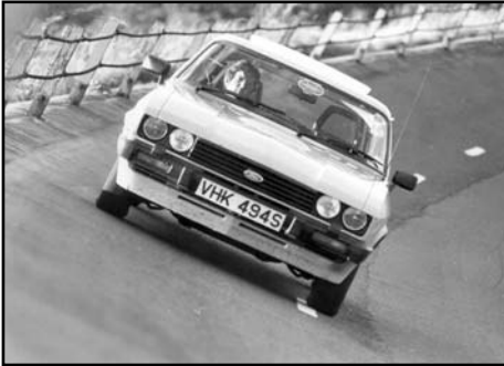
Ford Capri 3.0S: 130 mph max, MIRA