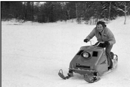
Alternative transport, Finland