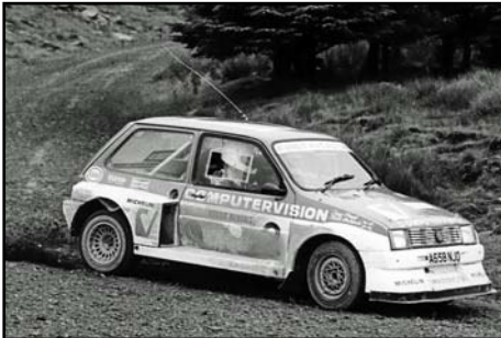
+ Tony Pond, MG Metro 6R4