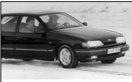
Winter precision, Ford Granada, Rovaniemi