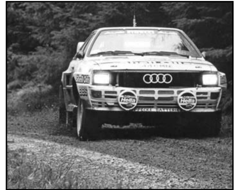
+ Hannu Mikkola, Audi Quattro A2