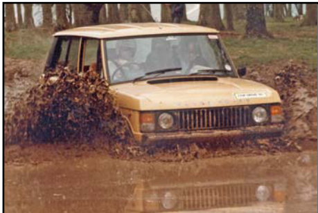
+ Range Rover, Exercise Cop Drive, Salisbury Plain