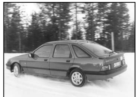
+ Stig Blomqvist, Ford Sierra 4x4