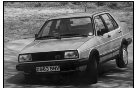
Driving for prizes: + VW Jetta GTi at Prescott Hill Climb