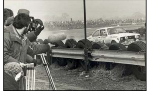
Another run for the cameras: filming Yorkshire Television's The Winning Streak