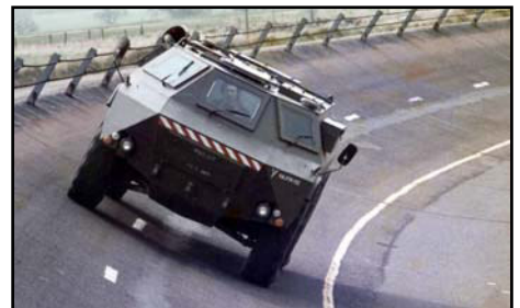
Feasibility testing: Vickers Valkyr APC