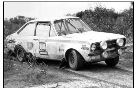
+ Escort BDA, prepared by Ford South Africa competitions department for Timo Makinen. "As long as the steering wheel's between the doors and there's a wheel at each corner, he'll drive it."