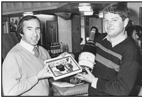
Formula Finesse winner + Jackie Stewart