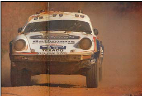
Paris-Dakar Group B Porsche 959 AWD