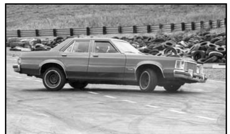
Bob Bondurant anti-hijack school, Sears Point