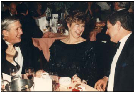
Make 'em laugh: their hearts and minds will follow