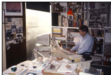
10th-floor eyrie, 10 minutes from Fleet Street