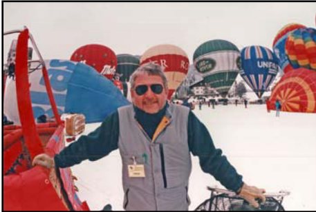
Hot-air balloon festival, Château-d'Oex, Switzerland