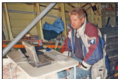
Airborne workstation, Mauritania Desert news room, Guinea