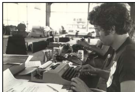
Kyalami press room