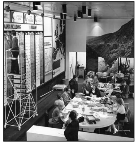
London-Mexico World Cup Rally HQ and newsroom, Daily Mirror, Holborn Circus